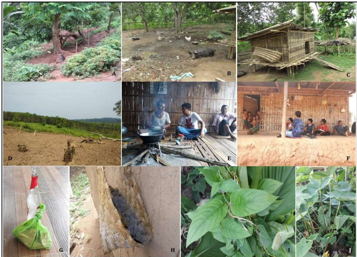
Figure 2. A, B: Typical pig rearing, C: Typical hut for chicken rearing, D: Commercial Land expansion, E, F: Data collection from the field, G: Rice beer ( Karbi ), H: Ashes (collected from jhum fields), I: Paederia foetida , J: Colocasia spp.

other products like ashes from jhum cultivation, alkali, and the first few drops of rice beer which are also used as a medicine and help in treating livestock ailments or disorders. For instance, Mange in dog or cat where ashes plus water is mixed and applied on an infected area. Thus, many plant species are used for the treatment of various disorders. Such indigenous knowledge indicates that the local communities in the study area have been able to carry this ancient wisdom. Due to poor road connectivity and inadequate facilities in the veterinary health service sector the people of some remote areas faced problems during the treatment of animals. For this reason, Karbi communities still depend on various medicinal plants for treatment in most of the diseases.